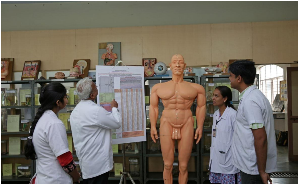
Life size (statues according to Charak Pramana and the convertible chart)