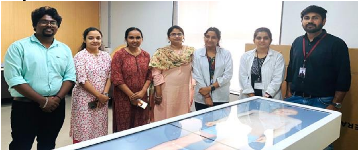
Bharati Medical Hospital, Pune Simulation Lab visit for PG Students