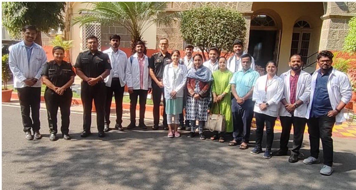
Armed Forces Medical College Pune visit- Faculty with PG Students