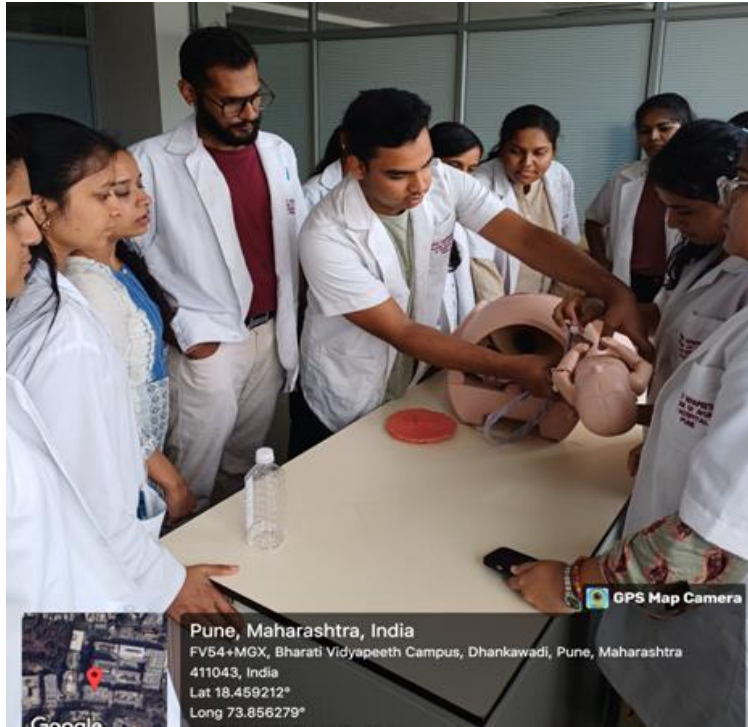
Bharati Medical Hospital , Pune Simulation Lab visit for UG Students.